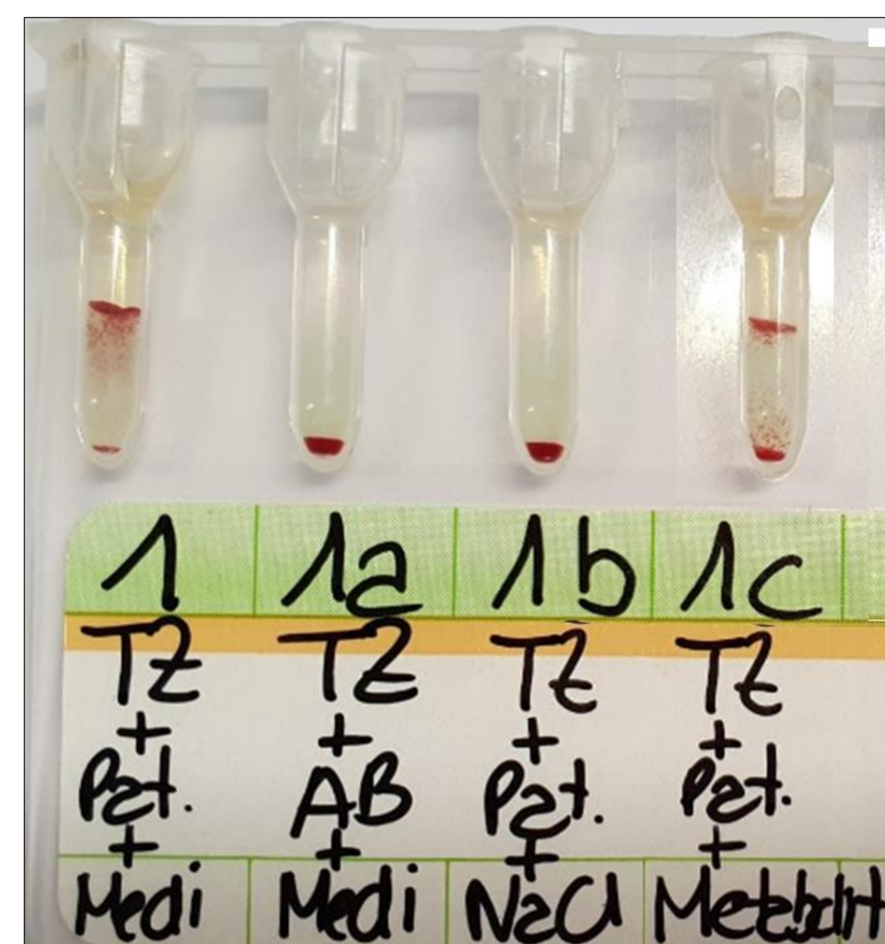
Fig. 3: Sera from the patient was incubated with group O RBC in the presence of Ceftriaxone (1) as well as its metabolites (1c) (patient's urine sample). Negative controls: random AB serum instead of the patient's serum (1a) and saline instead of drug (1b).